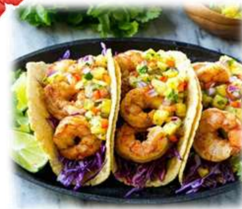
TROPICAL SHRIMP TACOS

Our next Health & Wellness class, The Healing Art of Music , is scheduled for Monday, June 23 rd in the main room at 10:30 a.m. , and will explore how music can be more than just entertainment—it can be a powerful tool for healing and happiness. Research shows that music can reduce stress, boost memory, improve sleep, and even ease physical pain. In this uplifting session, we'll dive into the science behind how music affects the brain and body, and we'll enjoy a mix of listening, sharing, and light rhythm activities. Whether it's a favorite song from the past or a new melody that lifts your mood, music has a unique way of connecting us to joy, comfort, and each other. Come ready to tap your toes, reminisce, and experience firsthand the wellness benefits of sound.