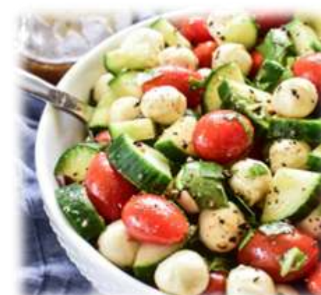
CUCUMBER CAPRESE SALAD